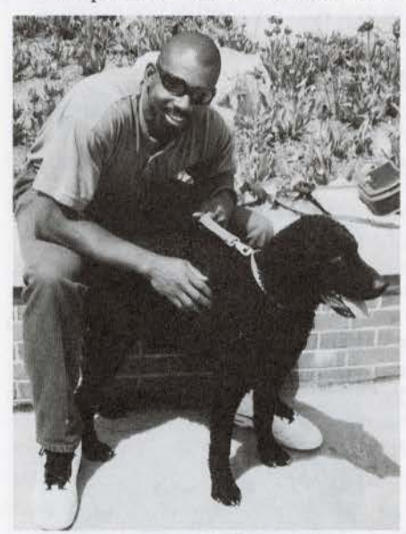
Antoine "Big Dawg" Carr of the Utah Jazz in a promotional TV spot for Strut Your Mutt.

I suspect it had much the same effect on Mayor Deedee