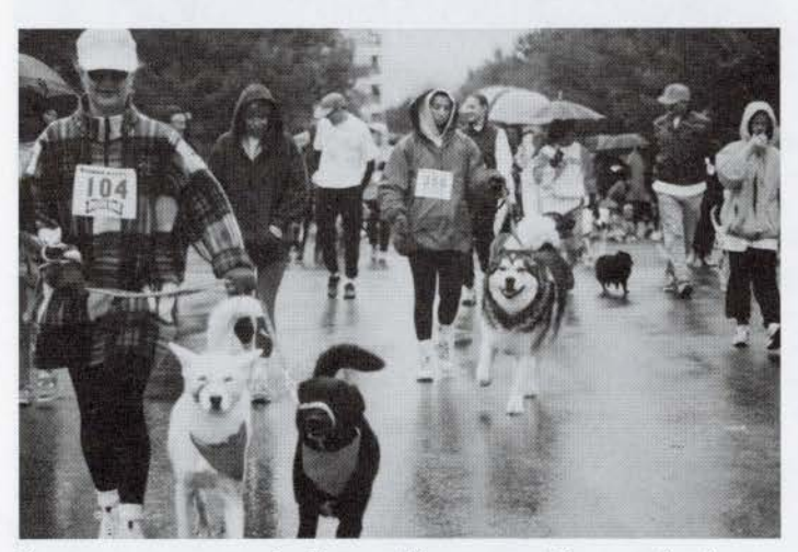
Last year, we organized everything except the weather!

Before we dissolved into hilarity, we did, at least, manage to cover most of the practical stuff: